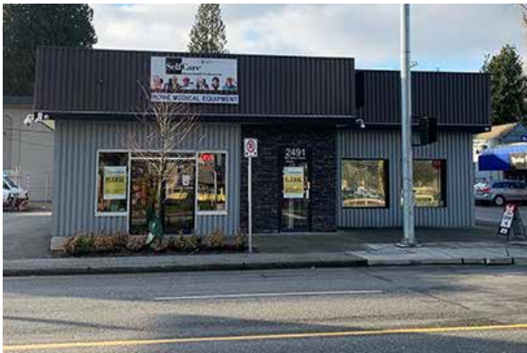
BUILDING - FRONT VIEW | EAST FACING