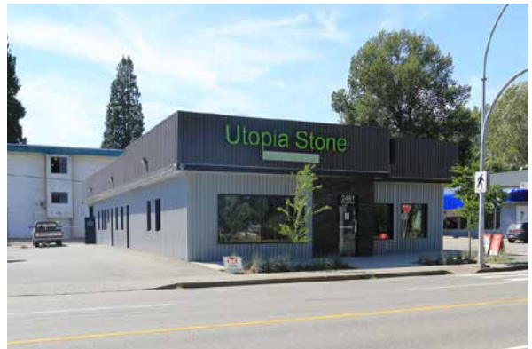
BUILDING AND PARKING | EAST FACING

This document has been prepared by Swaran Dhaliwal for advertising and general information only. Swaran Dhaliwal makes no guarantees, representations or warranties of any kind, expressed or implied, regarding the information including, but not limited to, warranties of content, accuracy or reliability. Swaran Dhaliwal excludes unequivocally all inferred or implied terms, conditions and warranties arising out of this document and excludes all liability for loss and damage arising there from. This publication is the copyright property of Swaran Dhaliwal or its licensor(s) 2020. All rights reserved. This communication is not intended to cause or induce breach of existing listing agreement. Innovative Real Estate Advisors "Commercial Real Estate".