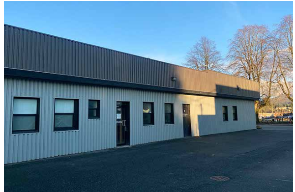
BUILDING - SIDE VIEW | SOUTH FACING