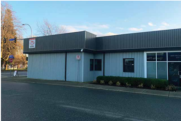
BUILDING - SIDE VIEW | NORTH FACING

RETAIL EXPOSURE FLEXIBLE | TOTAL OF: 4072 sq ft